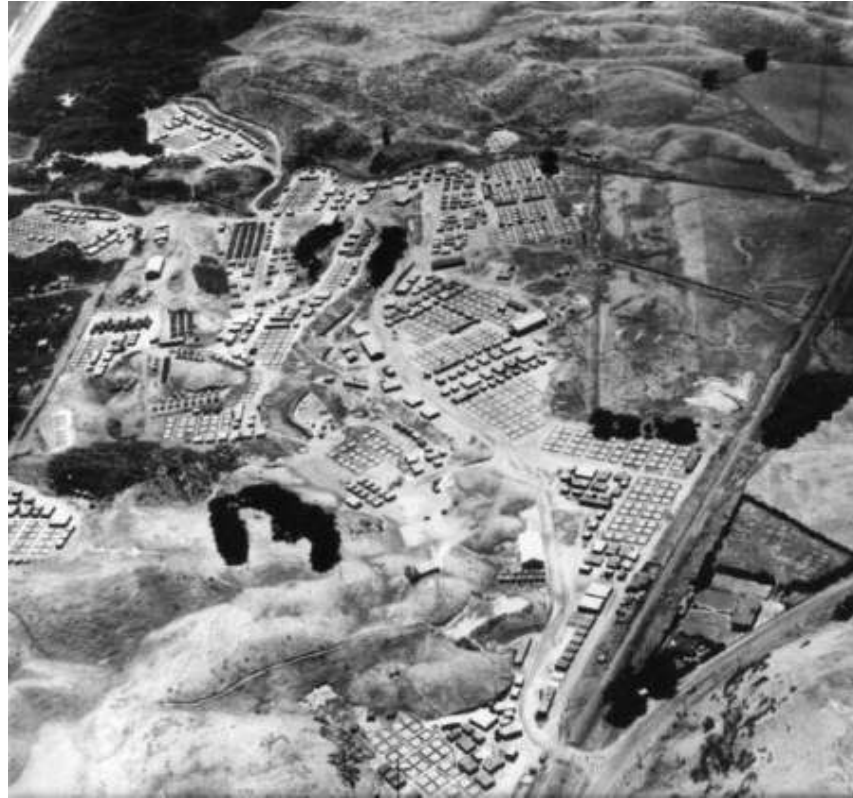
WWII Camp Paekakariki

This land contains a portion of the WWII Camp Paekakariki that helped maintain peace in New Zealand.