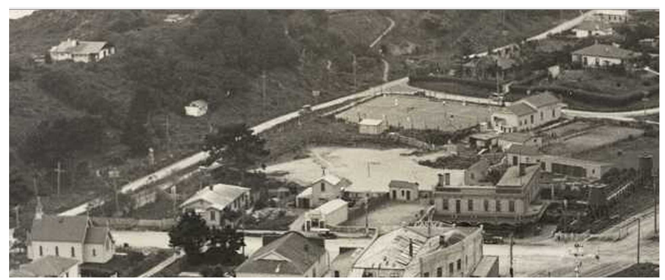
From the south

The young children manufactured and sailed their own craft on the lake. When the lake was drained around 1918, some wooden weapons - spears were found in the bed.<sup>1</sup>