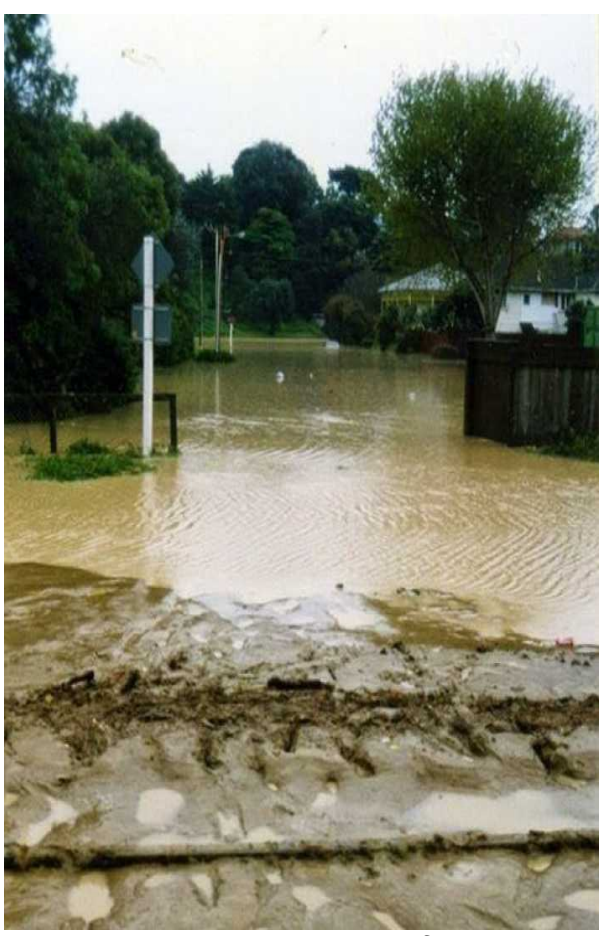
Robertson Rd houses flooded