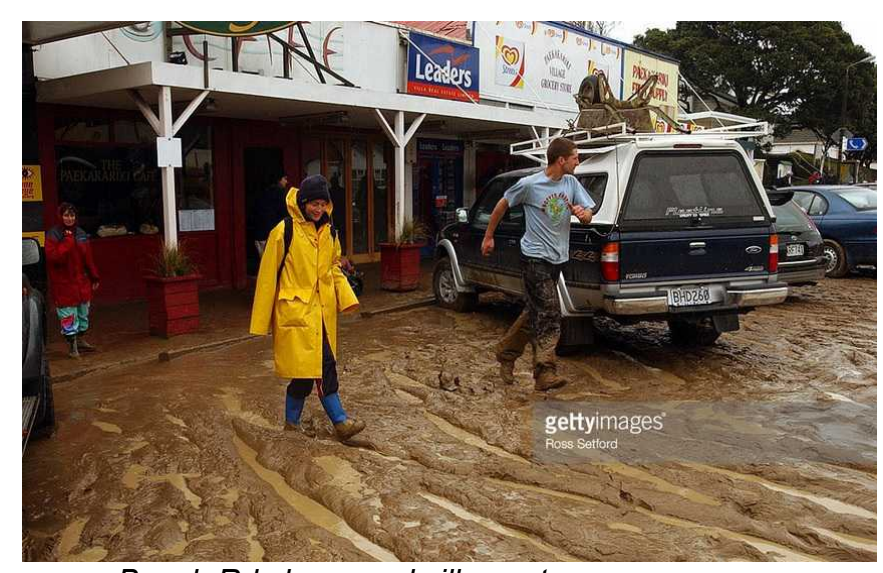
Beach Rd shops and village store