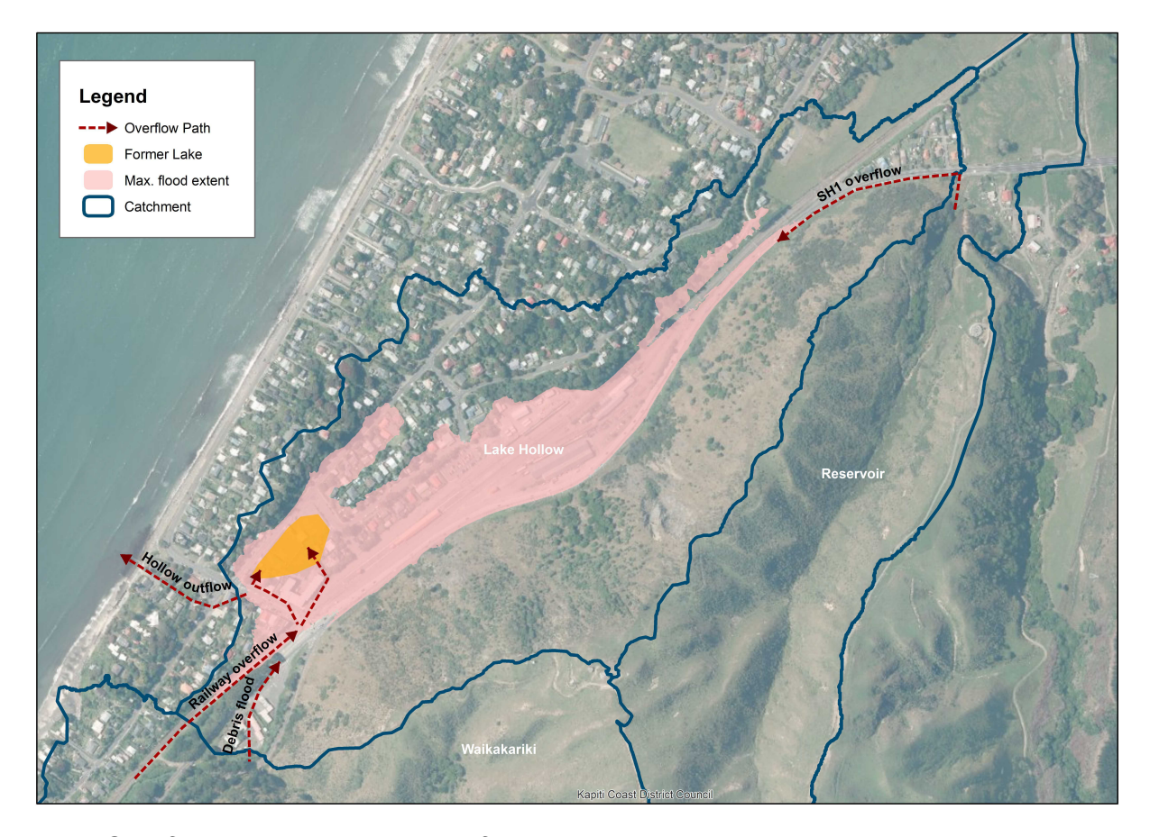
Overflow paths into and out of the Lake Hollow catchment