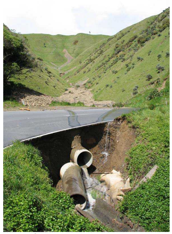
Council's Paekākāriki Hill Rd was severly impacted