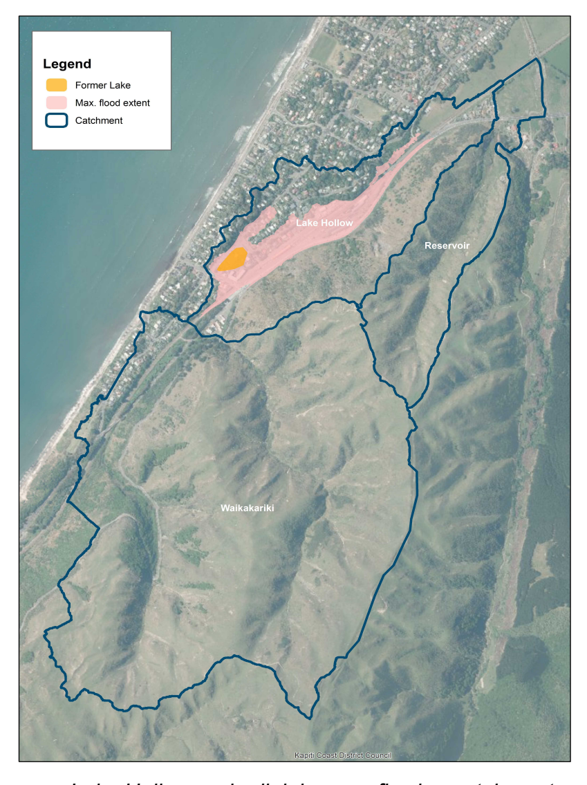
Lake Hollow and adjoining overflowing catchments

When debris floods occur the stream banks are overtopped and debris flood waters travel north through the Belvedere Motel to the crossing.