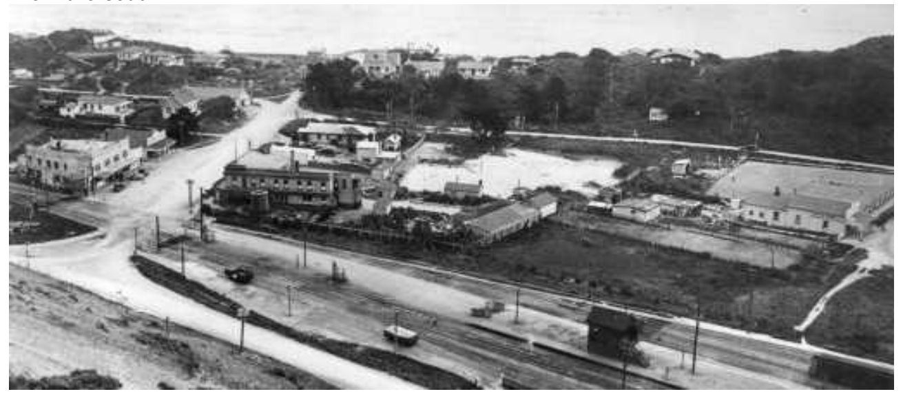
From the east

1929 - remains of the lake between Wellington Road, tennis courts and the Post Office.