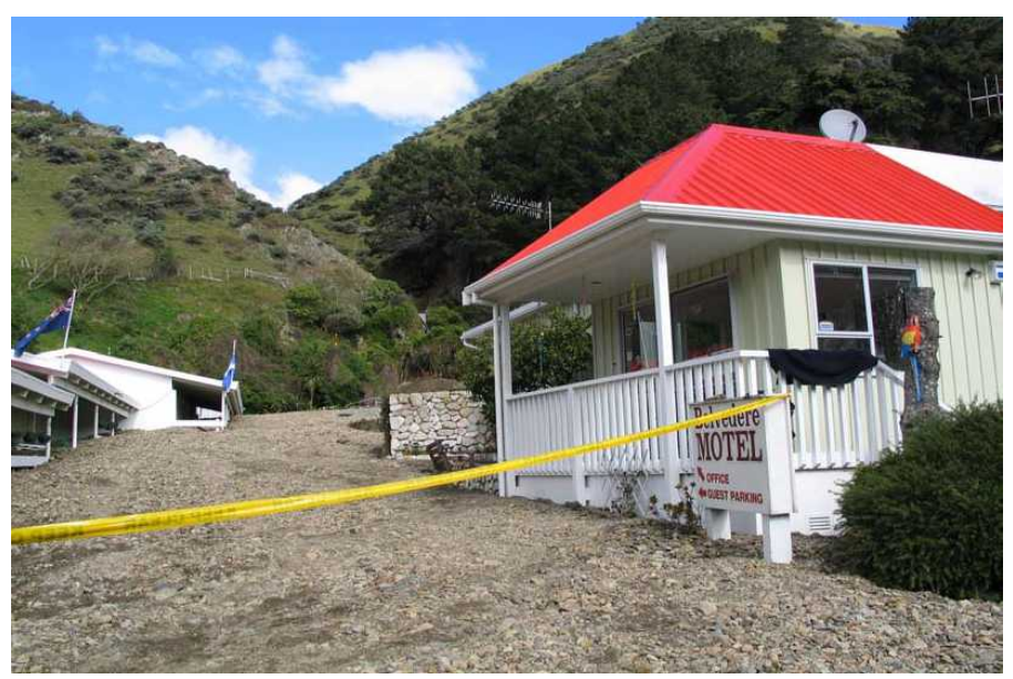
Debris flood through motel

It flowed through the Belvedere Motel area.