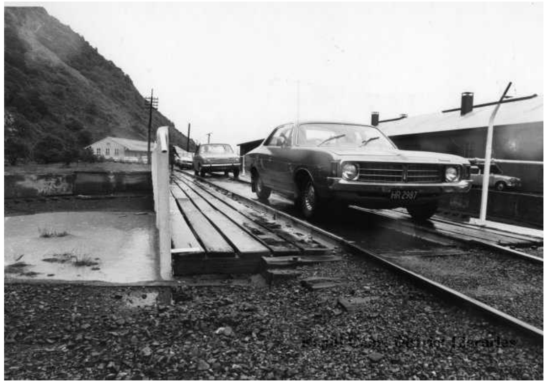
1979 floods – SH1 traffic diverting through rail yards and across the turntable