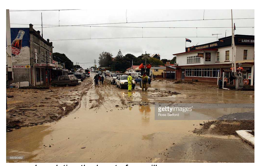
Inundating the heart of our village