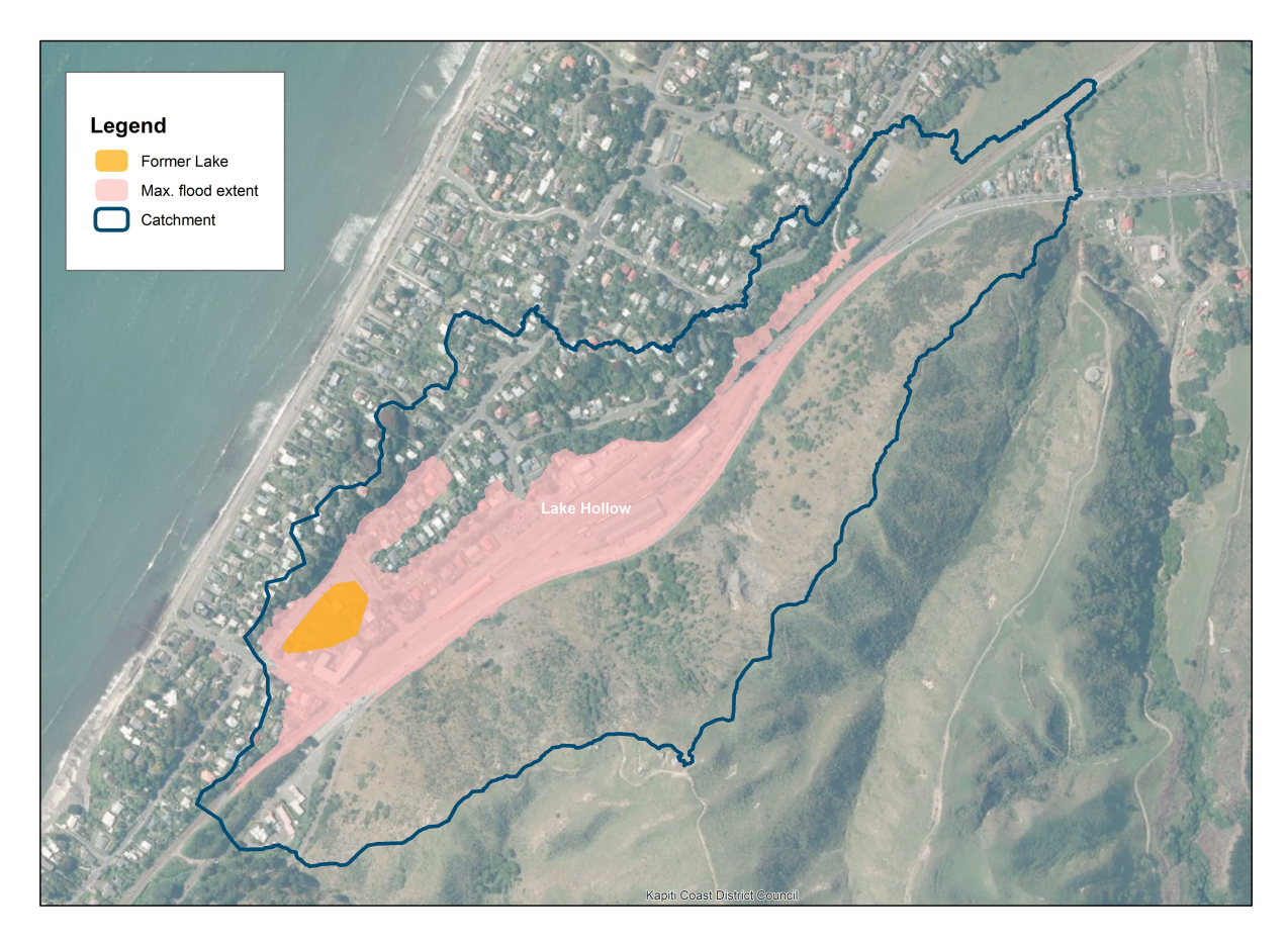
Lake Hollow catchment

The Lake Hollow catchment includes some of the village and a significant portion of the prominent scarp opposite the railway station.